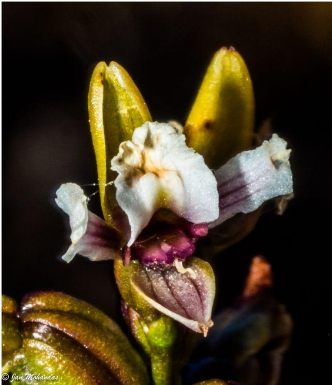
Prasophyllum species – Mt. Hotham, VIC