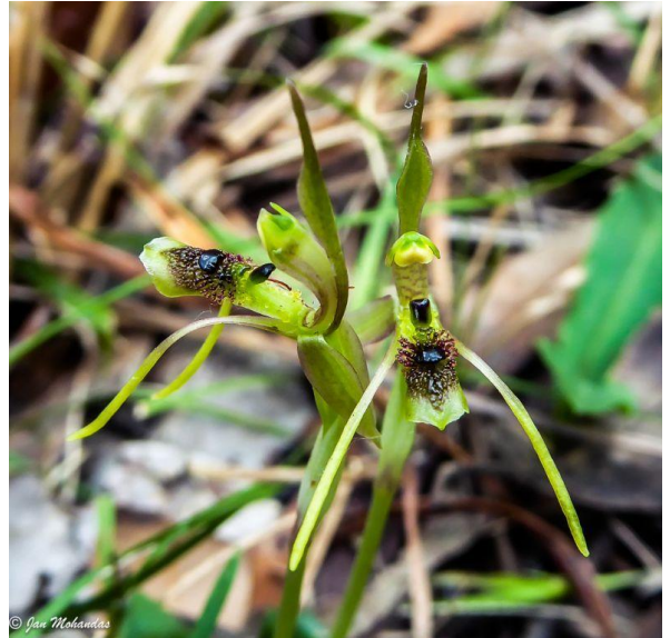
Chiloglottis species - Thirlmere lakes NP, NSW