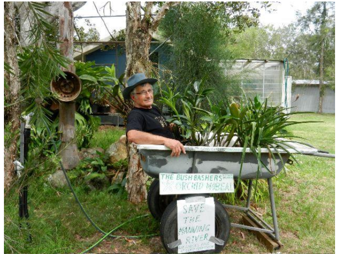
The "Bush Basher" amongst the healthy plants in the "Orchid Mobeal" all treated with the brew.