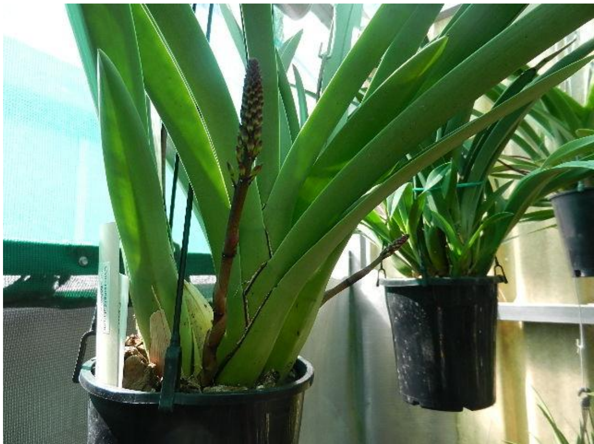
Bob's great results with Stronggrow Bio' Super Treat and Fert'