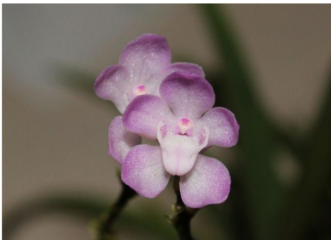
Sarco. ceciliae