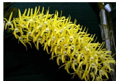
Den. speciosum v grandiflorum 'Will's Gold'

NOTE: It is important that the original name tag and number remain with the plant during the competition for judging identification purposes.