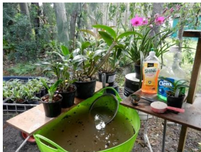
All the tools, container, products you need to treat and dip your plants.

I use Bio' Super Treat and Fert' straight after flowering and again in March to maintain a healthy growing medium. If there is a pathogen spreading in a pot we can easily restore the mix back to normal and healthy by dipping the plant roots with all old growing medium in a bucket of the brew mixed in water, with the additional of a wetting agent spreader (such as a citrus based dish-washing detergent like Shine or Earths Choice) and a very low toxicity hospital grade disinfectant (such as NU Cenz, or benzalkonium chloride (1.5%) from Coles or Woolies). Pool algacide at a low concentration can also be used as a potting mix disinfectant. In Stronggrow's Bio' Super Treat and Fert' there are 24 mineral compounds and vitamin (Vit') B complex supplements and other goodies that plants require and benefit from.