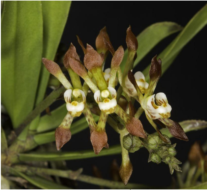
Plant of the Evening & AON 1 st Popular Vote Sarcochilus dilatatus – L. & B. Dobson