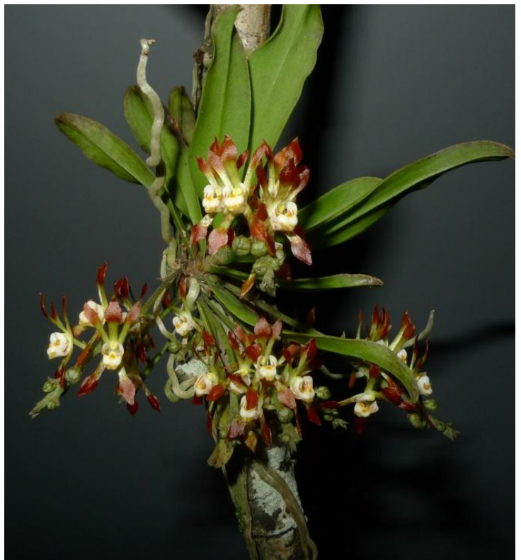
Sarcochilus dilatatus