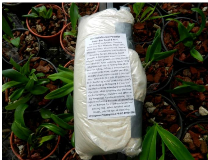
Stronggrow's orchid mineral growing powder (1.3 Kgs.) ready to go with instructions on the bag.

Following this long period of testing and trial and error I believed that I had developed a top quality and low toxicity mineral powder mix, more suitable to the long term sustainable growth of orchids than any other product on the market. To test the growing powder further I then arranged some informal field trials with 6 growers with it to be used on various plants in their collections. All 6 growers that are using it are still excited about the results they have been seeing using this basic fundamental mineral treatment for their orchid bark mix. The orchid mineral growing powder I developed I've named Stronggrow's Bio' Super Treat and Fert' .