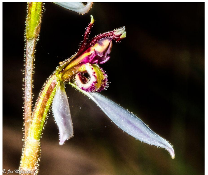
Eriochilus cucullatus - Mt. Kosciusko NP