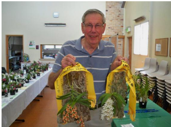
Three Champions at the Sarc Show!