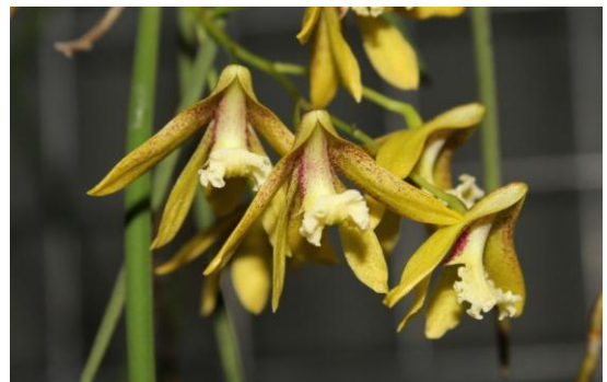
Dock. fuliginosa x bowmanii