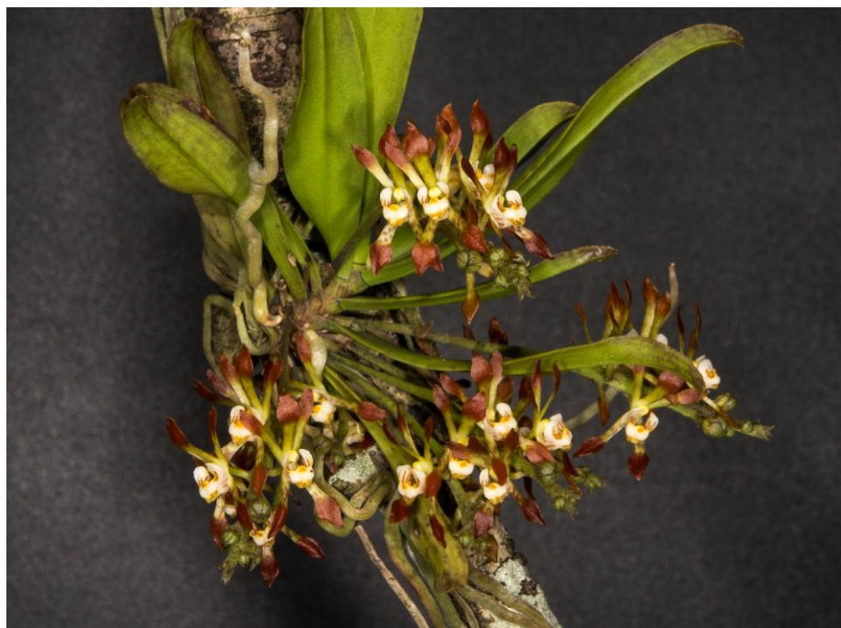
Sarcophilus dilatatus 'Lily' FCC-ACC/ANOS 2017 (provisional)