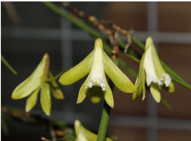
Dendrobium bowmanii