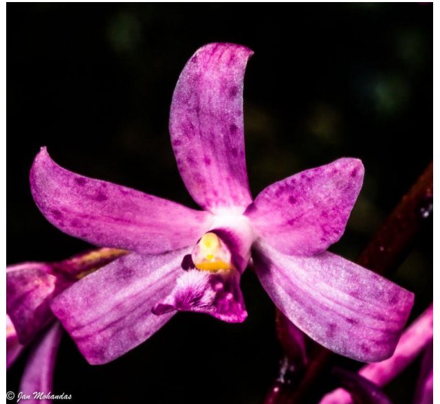
Dipodium roseum – Mt. Kosciusko NP