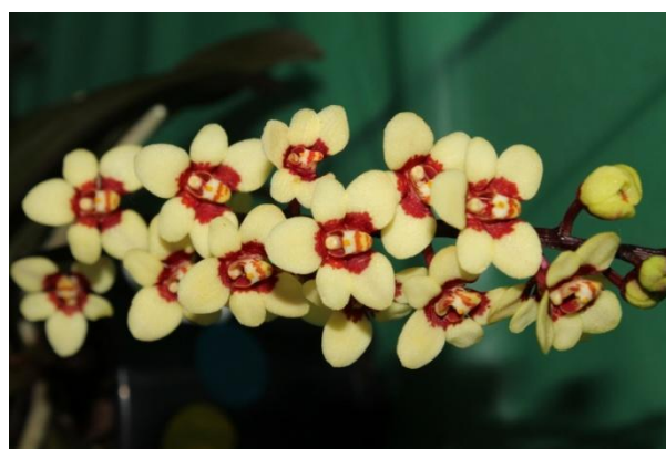
Sarcophilus hartmannii Galaxy 'Cream 2011'