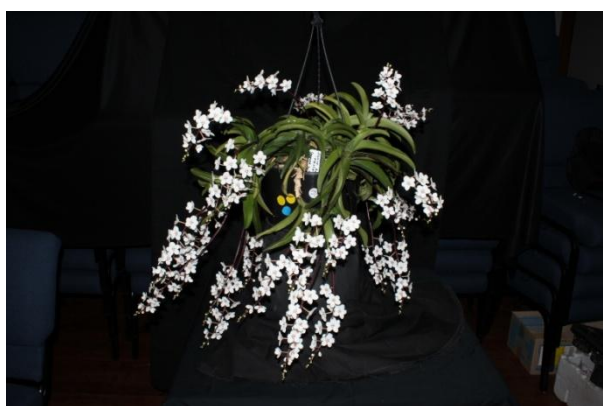
Sarcophilus hartmannii 'Tristen'