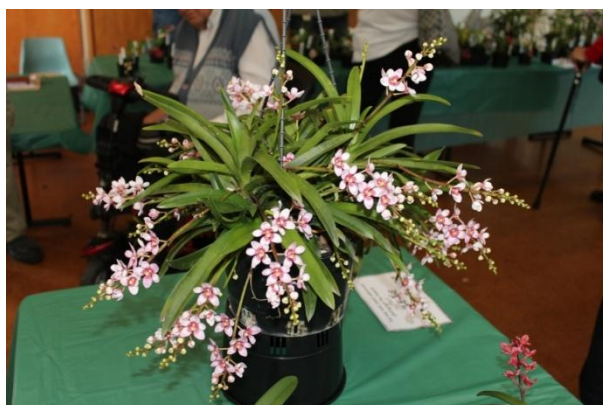
Sarcophilus Dove 'Good' HCC/AOC