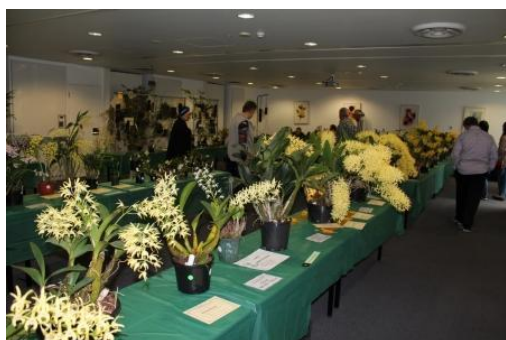
2016 Spring Show Eden Gardens

Our shows and displays are now finished for the year; I would like to thank everyone for their participation and support. I believe our shows were a great success this year and look forward to building on this in 2017. We have held two displays this year and it looks like we can grow our membership through these displays. It's a wonderful chance to sell your orchids to the public as well. However I do need to remind you we should only sell orchids that you would be happy to purchase yourself. If plants have recently been re-potted or plants are under stress then you should hold them back until they are in show or sale condition.