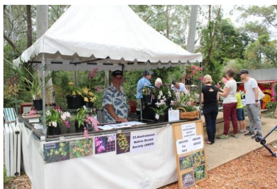
Our display kiosk.