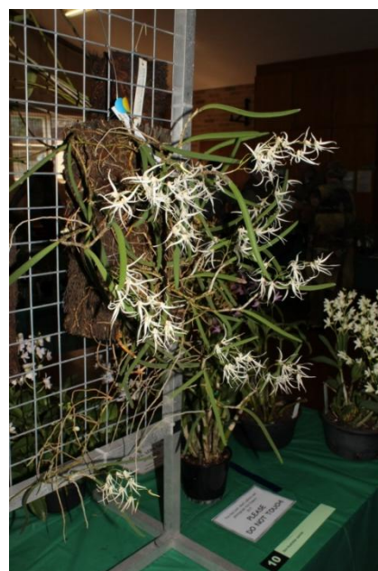
Sarcophilus Dockrillia x grimesii