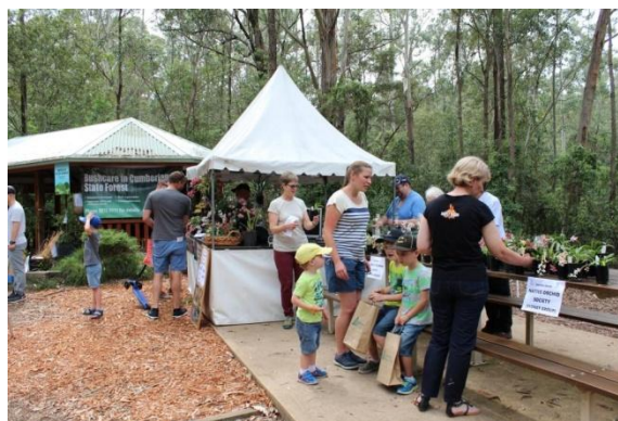
Our sales table kept busy the whole day!