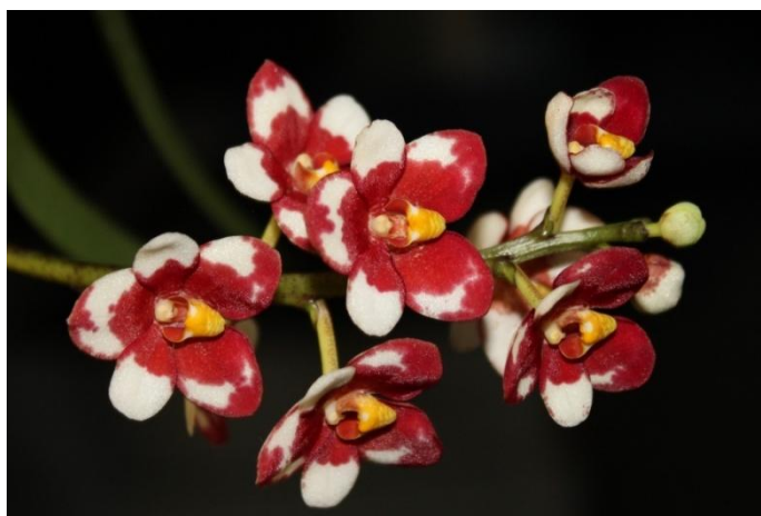
2nd Popular Vote – Sarco. Bessie (Y&S Chan)