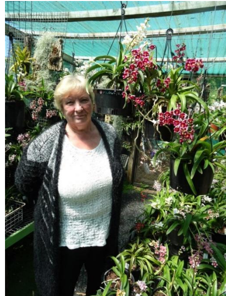
Some of Clover’s beautiful Sarcs!

Clover: I record all our orchids in a database and have somewhere between 1,000 to 2,000 native orchids in our green houses at any given time. Of these, we have close to 1,200 Sarcochilus orchids.