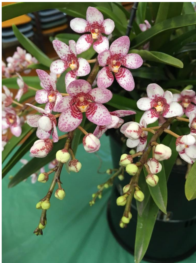
Sarcocylus Dove 'Good' - Champion Specimen Hybrid Sarcanthinae Show 2016

"Miniature orchids and their influence in breeding"