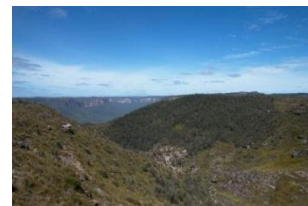
Mt. Banks view

We have conducted two walks so far this year; one to a new place at Crosslands Reserve in Hornsby and the second to Mounts Banks and Mount Wilson. These were well attended and we hope to carry this on over the next month or two.