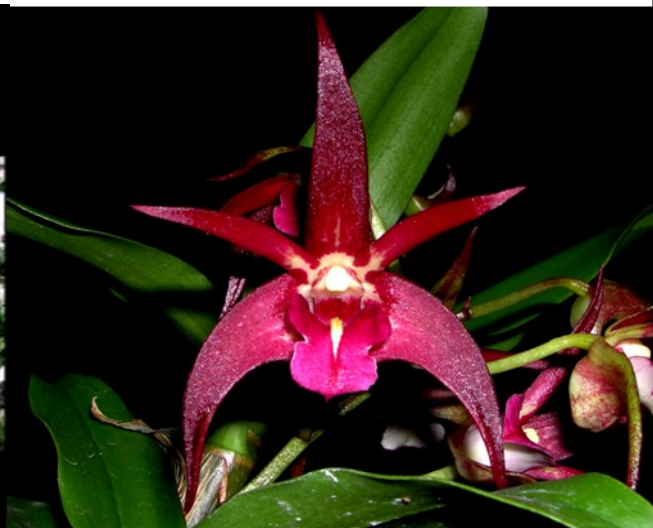
Australian Chocolate Starfish 'Gloss Red' x Starsheen 'Terra Cotta'

info@australianorchids.com.au www.australianorchids.com.au