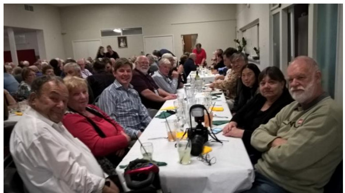
ANOS Sydney Group Members & Friends