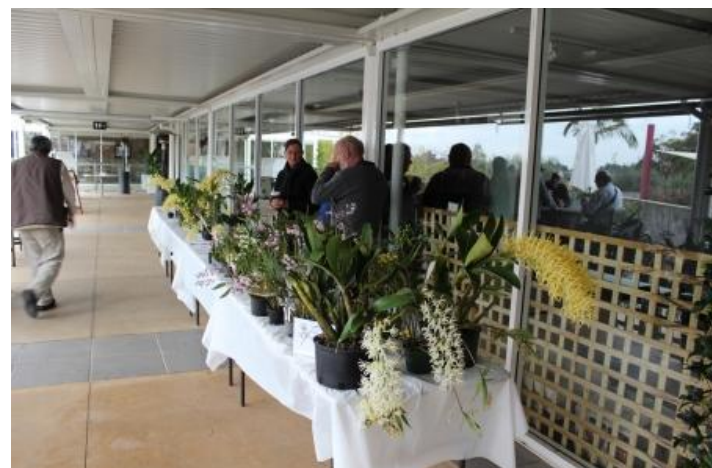
Spring Show Sales Tables