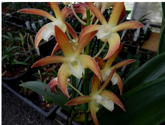
Den. Claro Sunset