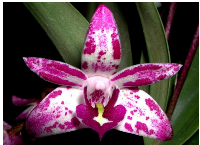
Den. Flinders Gray Lady Australian Orchid Nursery

info@australianorchids.com.au www.australianorchids.com.au