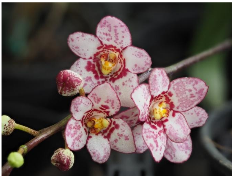
Sarcochilus Botanic Ridge 'Rave'