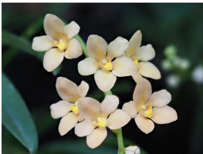
Sarcochilus Earth's Sun