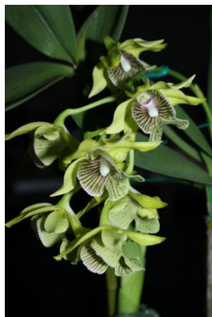
Den. Lime Delight