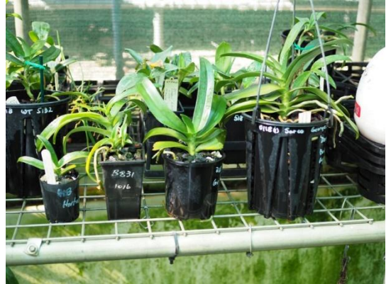
Progression pot sizes and below future champions?

I like the anti-spiral pots because they suit my culture of heavier fertilising and watering.