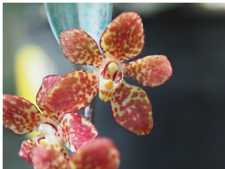
Sarcochilus Daybreak 'Spotty'