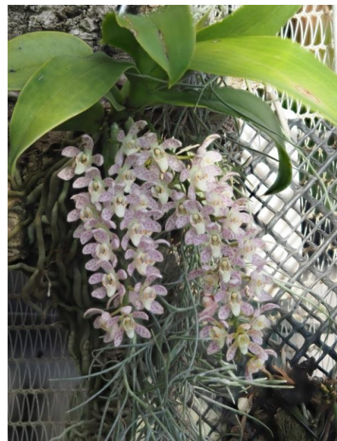
Peristerchilus [Prschs.] Olive Grace 'Lavender Grace'