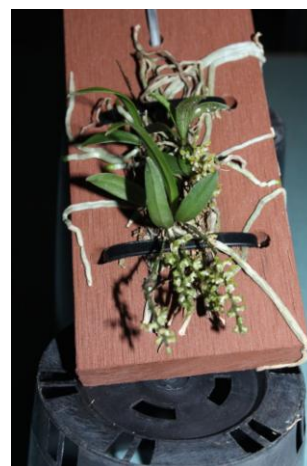
Saccolabiopsis armitii - Y. & S. Chan