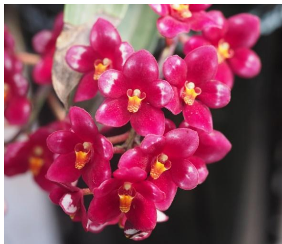
Sarco. Duno Nicky's Twin 'Eloise' x NABIAC 'Red Bull'