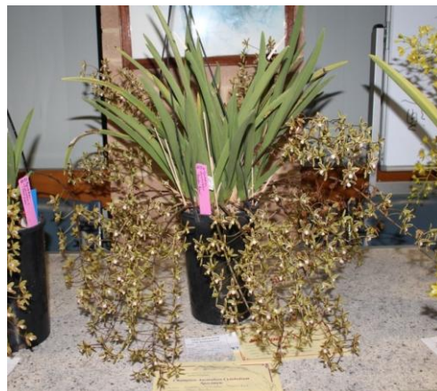
Cym. canaliculatum 'Kenebri Rd'