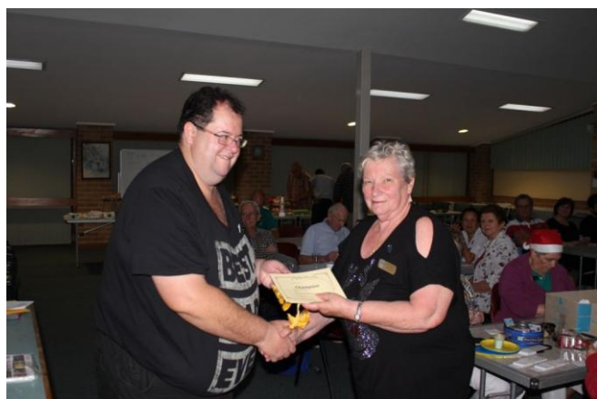
Clover Bradley Champion Specimen Sarcanthinae Hybrid